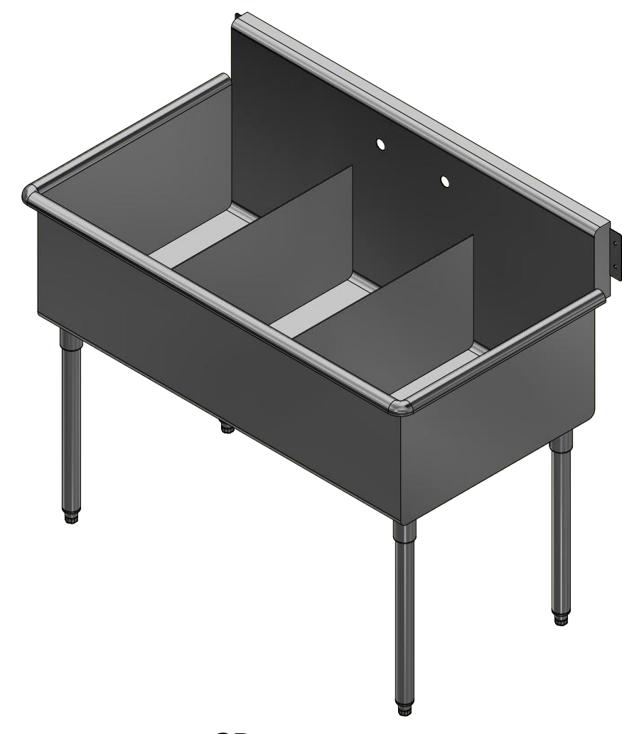
3D SCALE 1/12