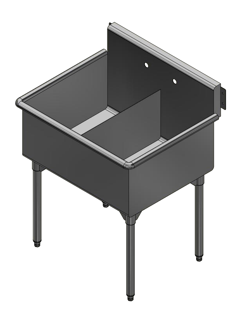
3D SCALE 1/12